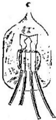
Standard range, 12-15 millivolt output